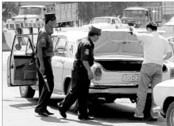
Police officers check a car in the Uzbek capital Tashkent on July 31 after suicide bombers hit the U.S. and the Israeli embassies.

"For the rest of it, it will be programmed as we get the money," she said. "I don't see this as being a budget threat."