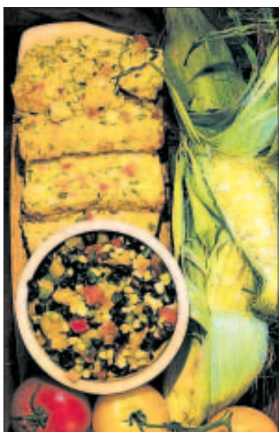
Summer's golden treasure: Fresh sweet corn, on the cob or off, as in this corn loaf and the roasted corn and black bean salad, is one of the season's greatest tastes. Flair, C1