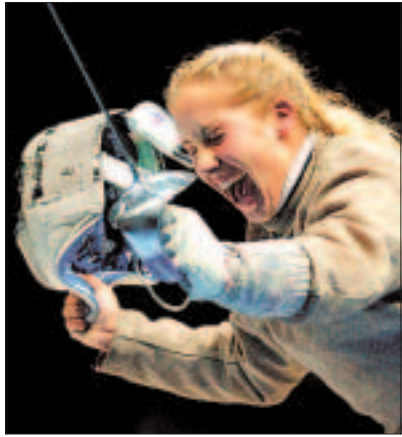
Rare moment: Mariel Zagunis celebrates after taking the gold medal in the Women's Individual Sabre competition on Tuesday. It was the first U.S. gold medal in fencing since 1904.